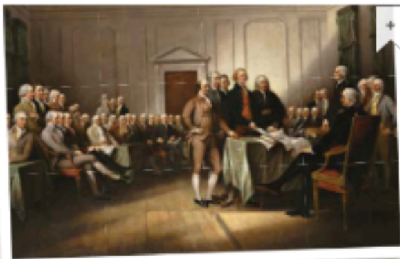
The signers of the Declaration of Independence.